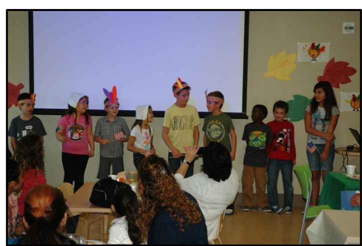
Some of the School Aged Children, dressed as Indians and Pilgrims, entertained guests with their rendition of Lee Greenwood's "God Bless the U.S.A."

Family members gather around a fabulous Turkey dinner provided by the CYP Staff. Moms and Dads ate lunch with their kids as everyone prepared for the holidays.