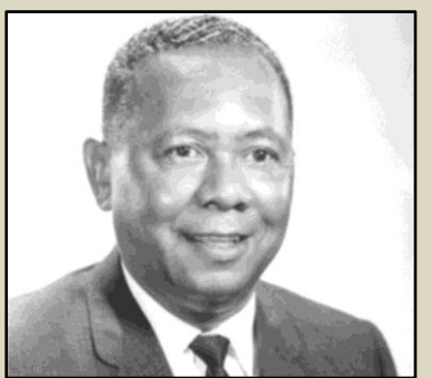
Dubois McGee, El Centro's first African-American Mayor and the driving force behind the Blue Angels coming to NAF El Centro for their Winter Training detachment